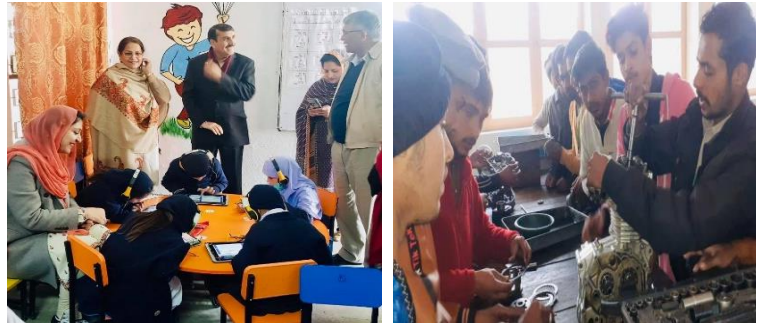
Glimpse of Moawin Foundation Activities