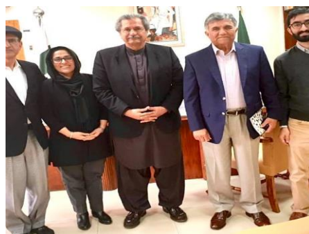
MF & TTWF Meeting with Federal Minister of Education & Technical Training

MF collaborated with Teach the World Foundation (TTWF) and started Pilot Project on Digital Learning through Tablets in IMSG(I-V) Alipur and IMSG(I-V) Tamma. The project was started on Oct,2019. Training of Teachers from IMSG(I-V) Alipur and IMSG(I-V) Tamma was also conducted by MF in collaboration with TTWF. TTWF conducted training sessions from Sept. 26h to Oct. 1, 2019 for teachers of both schools. 90 children of both schools were inducted for digital classes (30 children per class from KG- Grade 2).