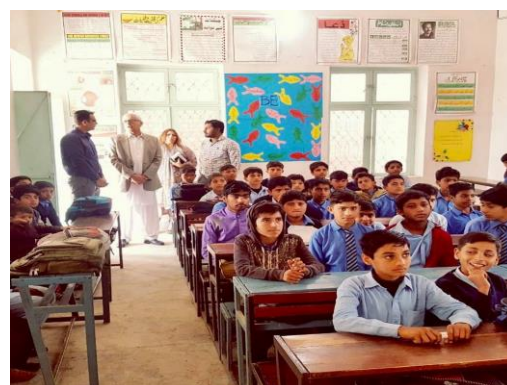
Visit of Moawin Foundation (Sheikhpura)

Life Skills Based Education being arranged in collaboration with AAHUNG, a Karachi based organization.