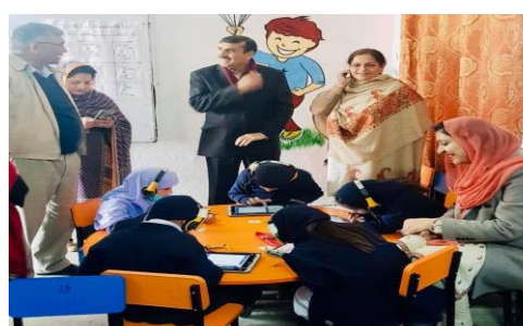
Visit of MF, Islamabad Adopted School

Total 12 schools were selected in October 2019. Activities includes training of Basic Teaching Methodology of 25 female teacher , Repairing & upgrading of 100 plus washrooms , 4 days "Professional