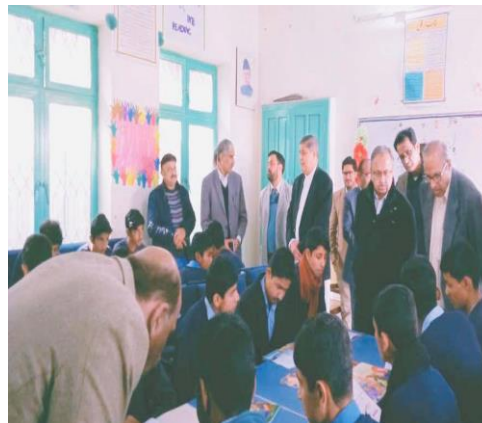
Visit of Board Of Directors in Schools of Moawin Foundation (Sheikhpura District)

In order to make the Government schools more effective following steps were taken.